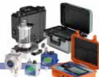
CONTAMINATION CONTROL SOLUTIONS