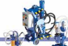
MOBILE FILTRATION UNITS