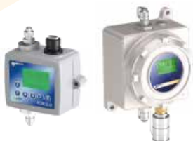
ICM 2.0 In-Line Contamination Monitor