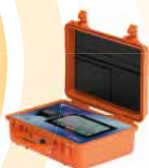
LPA3 Portable Light Extinction Particle Analyser