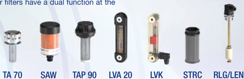
TA 70 SAW TAP 90 LVA 20 LVK STRC RLG/LEN

tank inlet in the filtration of the incoming air and the pre-filtration of the fluid through the basket, in order to prevent the entry of foreign bodies during the filling or refilling operations.