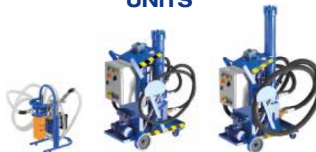
UFM 015 15 l/min (3.96 gpm)